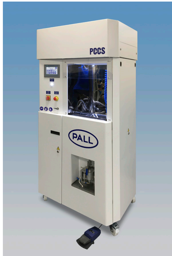
PCCS Series Component Cleanliness Cabinet