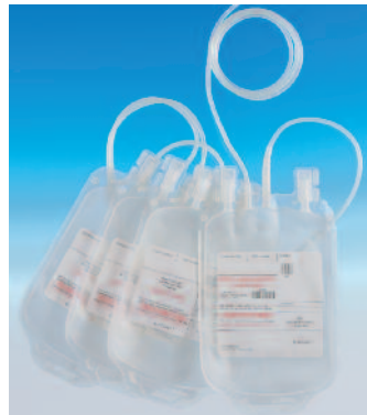
Reorder code: 136-94, CPDA-1 Quad