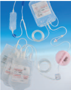
Reorder code: 126-92, CP2D/AS-3 Double

Indication: Filtration of whole blood up to 72 hours.