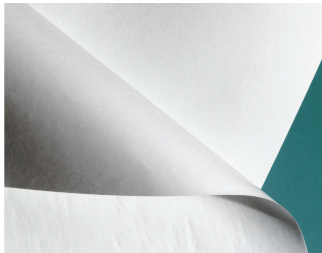
Versapor® TR membrane

Packaging: For widths up to 22.86 cm (9.0 in), shrink-wrap around each roll; for widths 22.86 cm (9.0 in) and larger, bag around each roll