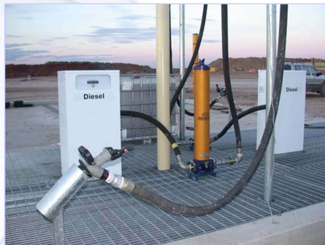
Pall Ultipleat ® SRT In diesel fuel applications