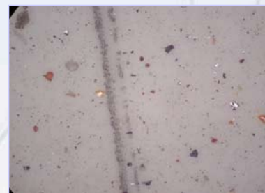
Photomicrograph of fuel contamination upstream of filter