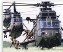
Sea King S-61

Pall Centrisep EAPS units have been protecting helicopter engines since the 1960's. More than fifty different designs have been certified and operate worldwide. They are used on a variety of rotorcraft including Agusta/Westland, Bell, Boeing, Denel, Enstrom, Eurocopter, Kaman, MIL and Sikorsky.