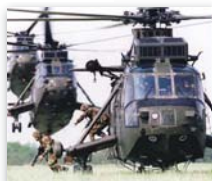
Sea King S-61

Pall Centrisep EAPS units have been protecting helicopter engines since the 1960's. More than fifty different designs have been certified and operate worldwide. They are used on a variety of rotorcraft including Agusta/Westland, Bell, Boeing, Denel, Enstrom, Eurocopter, Kaman, MIL and Sikorsky.