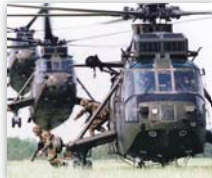
Sea King S-61

Pall Centrisep EAPS units have been protecting helicopter engines since the 1960's. More than fifty different designs have been certified and operate worldwide. They are used on a variety of rotorcraft including Agusta/Westland, Bell, Boeing, Denel, Enstrom, Eurocopter, Kaman, MIL and Sikorsky.