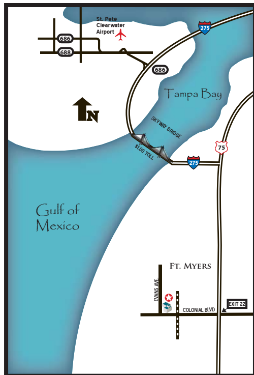
Map 2 - Fort Myers Facility (For Reference)

Park in any Visitor Parking on the Left side of the building.