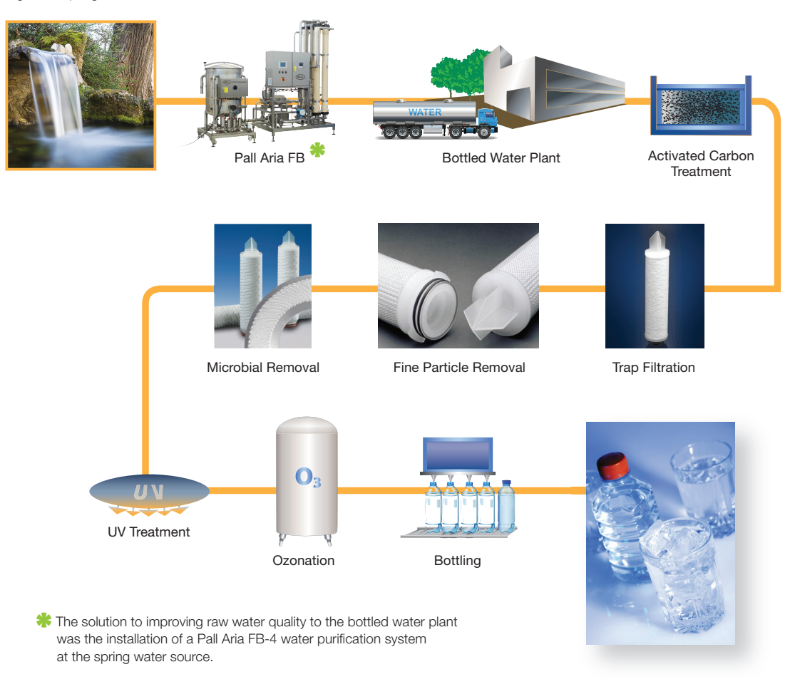
Figure 1: Spring Water Treatment Process at Bottled Water Plant<sup>1</sup>

set up and installation, operator training, and final system commissioning. Over the course of the rental period, guidance was provided to ensure proper operation and an understanding of system capability based on the application.