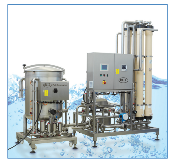
Pall Aria FB-4 Water Filtration System

As bottled water quality requirements had continually risen over the years in a very competitive environment, the bottled water company found that their filtration spend had grown to unsustainable levels. In addition, variable incoming spring water quality resulted in frequent filter blocking and high cleaning costs, frequent filter change-out, substantial water costs associated with backwashing the activated carbon bed, and related labor