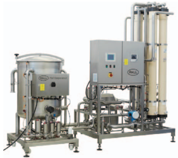
Figure 2 – Pall Aria FB systems for water filtration

The Pall Aria™ FB membrane filtration system (Figure 2) consists of robust testable hollow fiber modules installed on a stainless steel frame. The system runs in an automatic mode through a simple and easy-to-handle program. The system can be easily installed to treat difficult and critical water such as