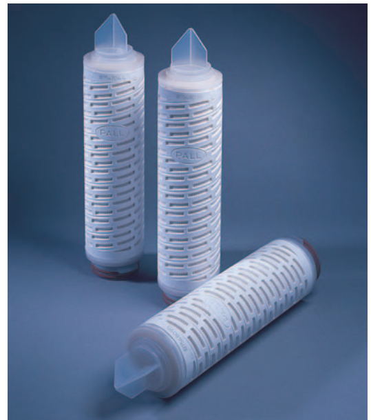
Figure 3 – Oenopure II 0.45 µm cartridges for water and juice filtration

Flat depth filter sheets are widely used in the apple juice process before final concentration steps, mainly for particle removal, turbidity stability, and Alicyclobacillus removal. Even if those filters