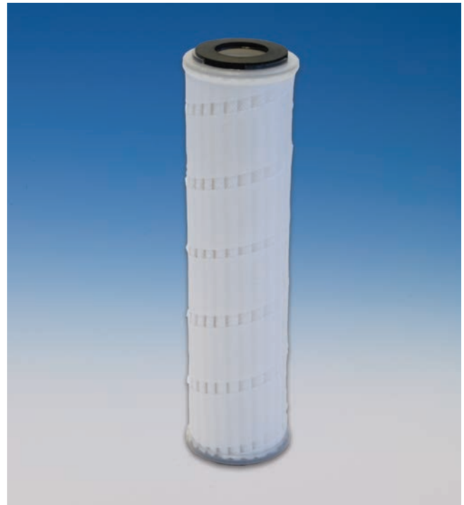
Profile UP Filter

For P and W options, the filters are constructed entirely of FDA-listed materials and the absolute rating of the filter is based upon the widely accepted modified Oklahoma State University (OSU) F-2 Filter Performance (Beta Rating) Test.