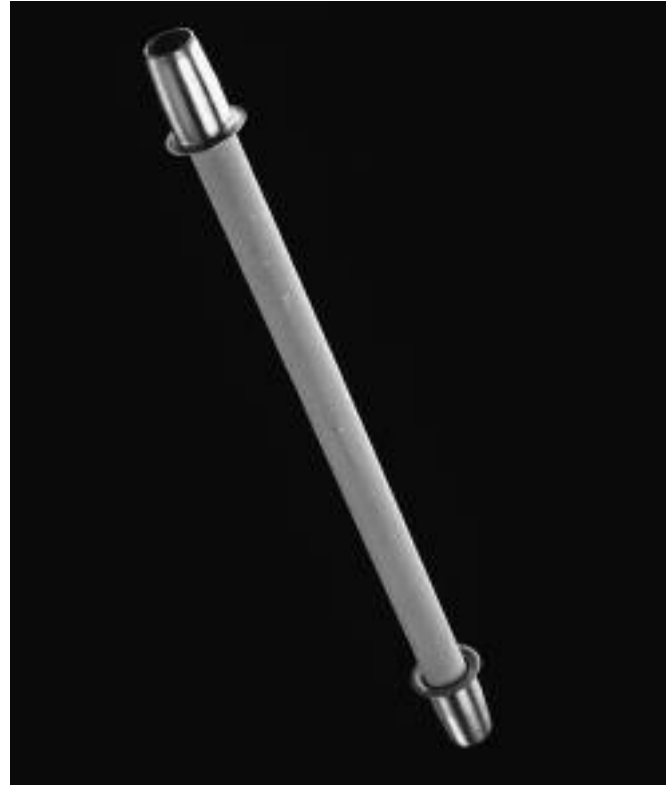
AccuSep™ Filter Element

Pall will provide custom configurations to meet your requirements.