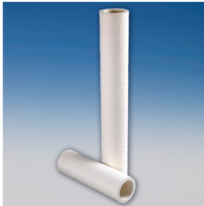
Medallion L/G Coalescer