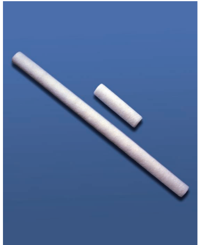
PhaseSep A/S Series Liquid/Liquid Coalescers shown