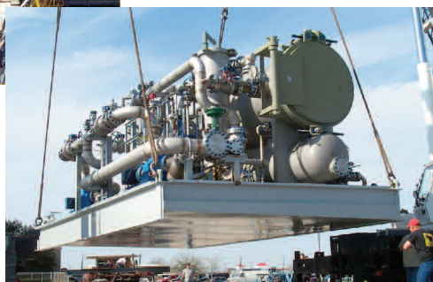
Ultradeep® high flow filter system