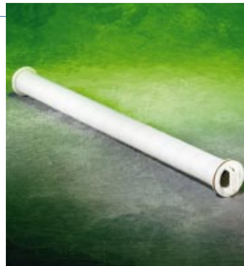
Pall PhaseSep HE Liquid / Liquid Coalescer