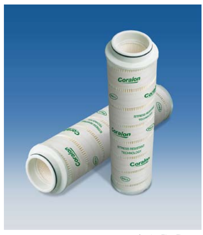
Coralon Filter Elements