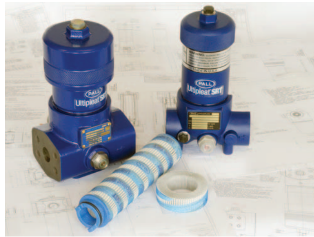
Pall Ultipleat SRT Housing Elements