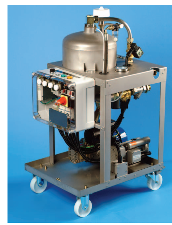
Pall HNP006 Purifier

Specifically designed for harsh industrial environments such as the mining industry, the WS08 Water Sensor features a modular housing concept, "plug-and-play" connectivity, simple on-site adjustment and calibration, and interchangeable sensor options.