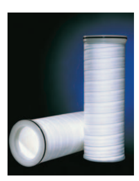
Pall Ultipleat High Flow Elements