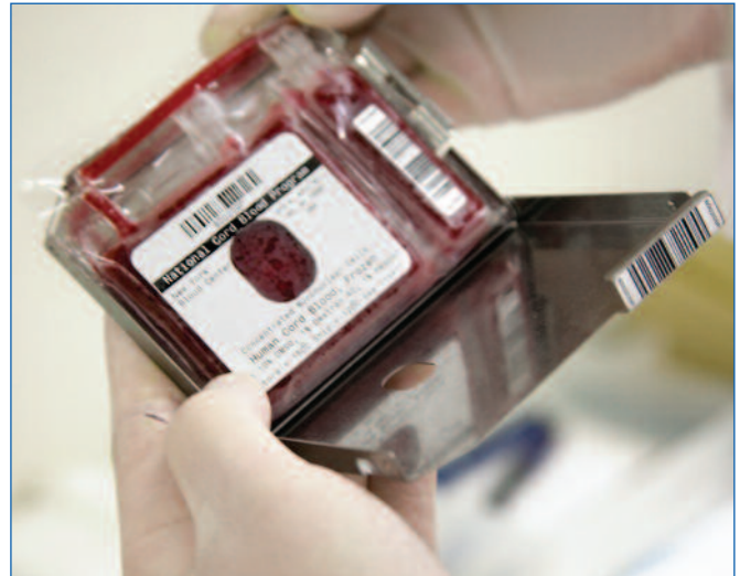
Pall's advanced freezing bag design divides the sample into two compartments, enabling a 4:1 division of sample for ex vivo cell expansion.

For disease treatments or patient populations that require a higher cell dose to be transplanted, Pall's advanced freezing bag design divides the sample into two compartments, facilitating transfusion of 80% of the stem cells while retaining 20% of the stem cells for ex vivo cell expansion. Scientific advances in our ability to amplify stem cells will greatly expand the applications for hematopoietic stem cells from cord blood.