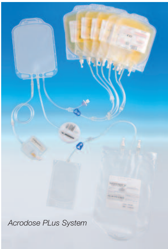
Acrodose P Lus System

Blood collection facilities can capitalize on the clinical benefits of single-donor platelets with the availability of WB-derived to meet increasing platelet transfusion requirements. Non-leukoreduced WB-derived platelets made with Leukotrap RC System with RC2D Filter can be pooled and leukoreduced using the Acrodose P Lus System to make a transfusion-ready, therapeutic dose of platelets that are clinically equivalent to a single-donor platelet, an Acrodose SM Platelet.