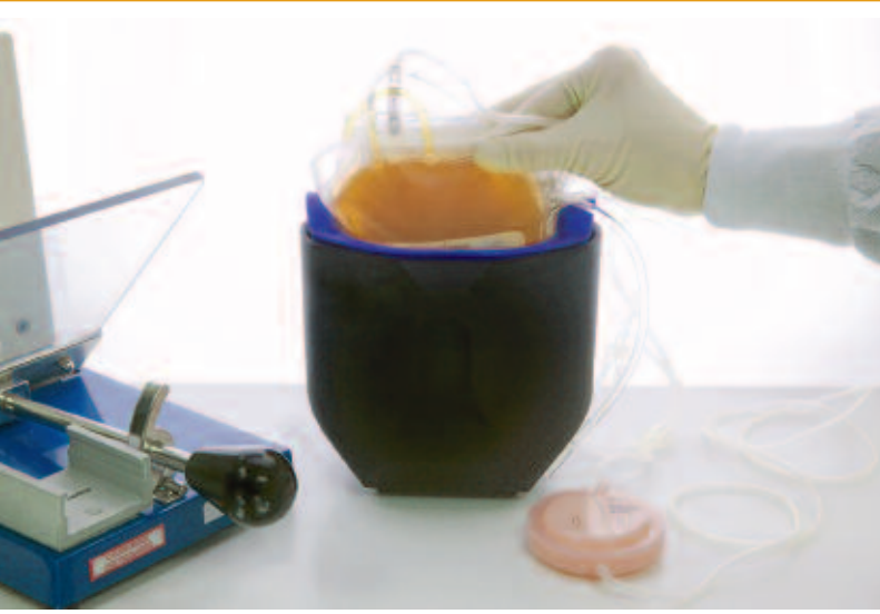
Leukotrap RC System with RC2D Filter

No longer is there a compromise between increasing component production and maintaining optimal operational efficiency when producing leukoreduced RBCs and plasma.