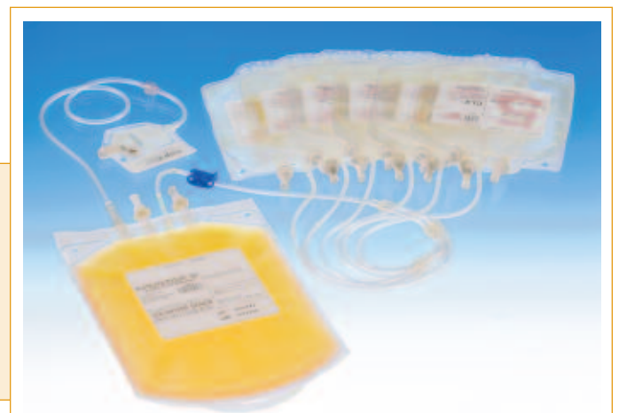
Acrodose PL System

Though RBC dockable systems are inherently more labor intensive than in-line systems for producing leukoreduced RBCs, a combination of standard blood collection sets and dockable leukoreduction systems may be the best solution to obtain your platelet and plasma needs. WB can be collected in standard trade bags – Nutricel ® Additive System or CPDA-1 Blood Collection Sets . The RBC can be processed using the Leukotrap SC RC System with BPF4 Filter . When the non-leukoreduced platelets are processed using the Acrodose PLus System you have the added availability of Acrodose Platelets .