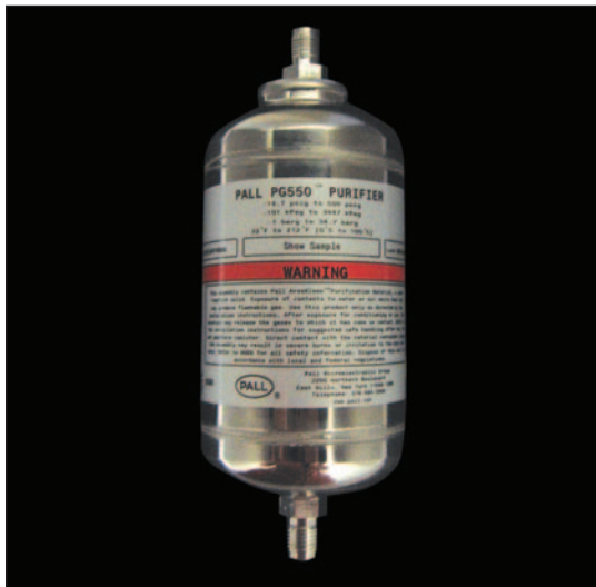
PG550 Series Gaskleen purifier