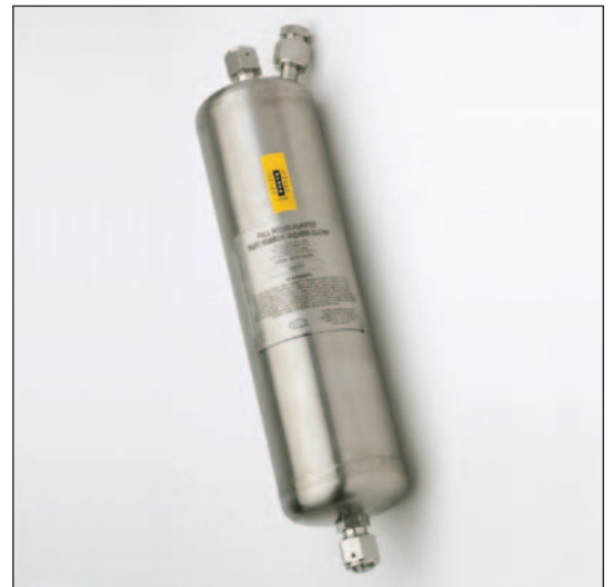
PG2400 Series Gaskleen purifier