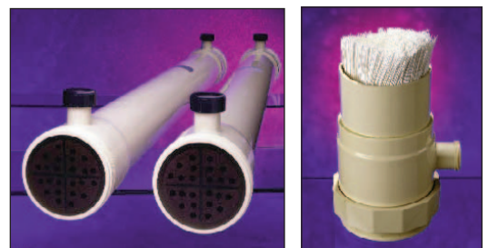
Fig. 1: Pall Microza* Membrane Module (left) and cutaway showing hollow fibers

The dynamic membrane filtration system incorporates porous hollow fiber membranes to separate particulate and colloidal matter from soluble components in the water. The membranes are arranged in compact modules (fig. 1).