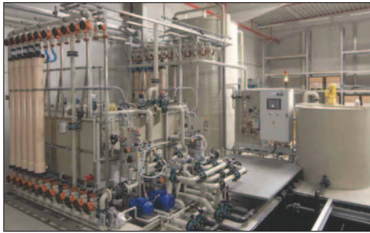
Fig. 2: Pall dynamic membrane system for 10 - 30 m 3 /hr / 44 - 132 gpm of spent sawing/ grinding process water, 2 x 75% capacity for redundancy, with process water supply unit

The Microza hollow fiber membranes are very permeable resulting in high water production rates. Each hollow fiber module provides a large active surface area of up to 50m 2 . These modules are used in Pall water treatment systems of various sizes and capacities (fig. 2).