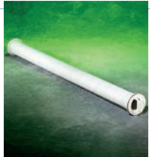
Pall PhaseSep HE Liquid / Liquid Coalescer