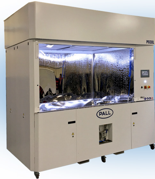
PCCXL Series Component Cleanliness Cabinet