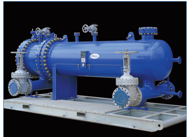
19-Around Simplex High Flow filter rental skid (side view) 1