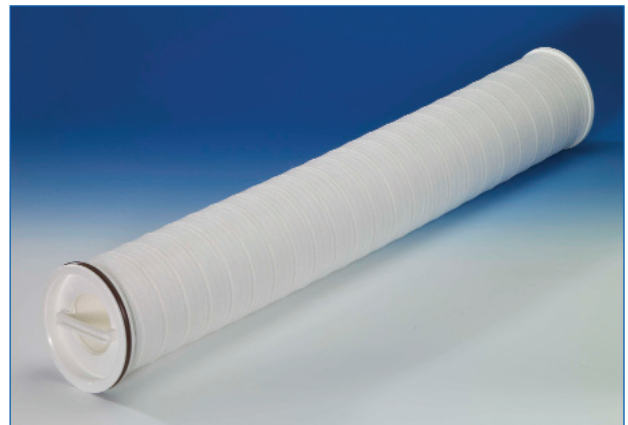
60 in Ultipleat High Flow filter element