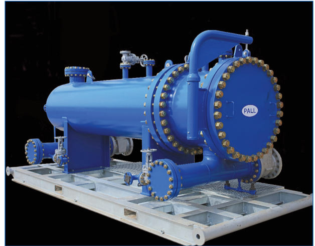
19-Around Simplex High Flow filter rental skid (closure view) 1