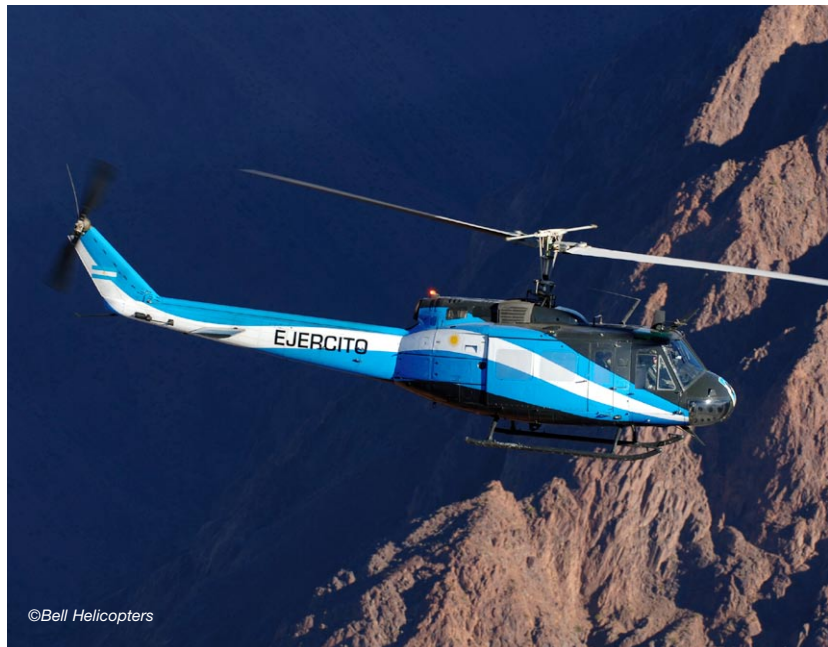
PUREair system for the Bell 205 / UH-1 helicopter