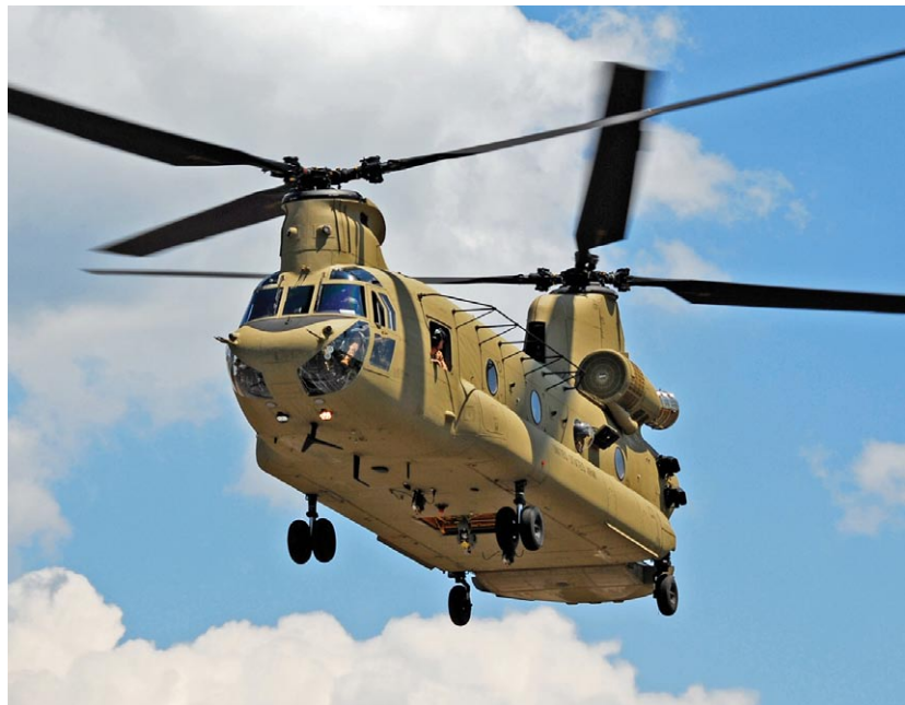
PUREair system for the CH-47 Chinook helicopter