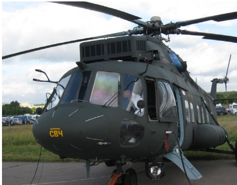
PUREair system for the Mi17 helicopter