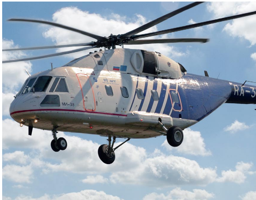
PUREair system for the Mi38 helicopter (prototype unit).