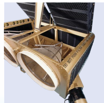
PUREair system for the Sea King, SH-3, S-61 helicopter