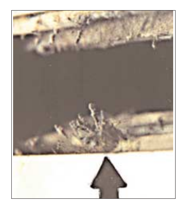
Figure 2 (Far Right)

We have noticed a light, continuous dust layer forming upstream of the filter media on cabin air