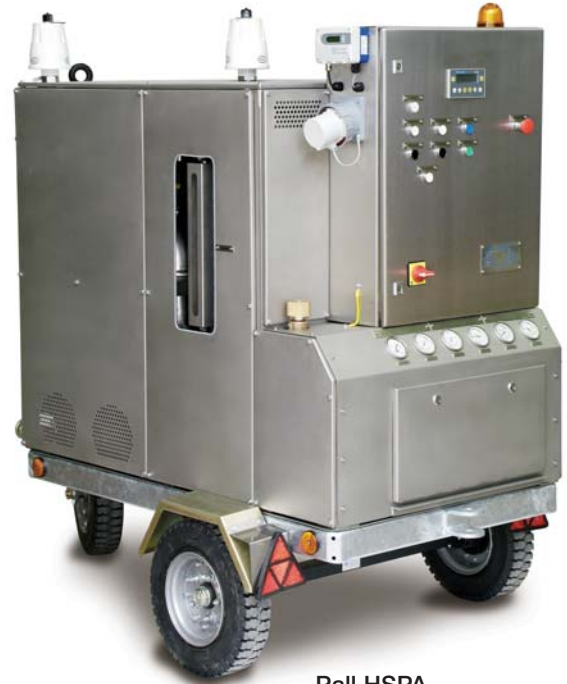
Pall HSPA Hydraulic Fluid Purifier

This unit has provision to connect a Pamas 3 S40 particle counter and contains suitable mounting position, electrical and hydraulic points for customer connection. The Pamas S40 is not supplied as standard with the HSPA181 purifier unit. For further details of the Pamas S40, please contact the Pall sales office