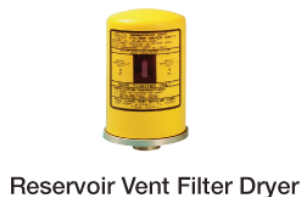
Reservoir Vent Filter Dryer

Discharge Filter Element Spin-on Replacement Instructions found on pg. 14 of Manual PLM-TM-97059*