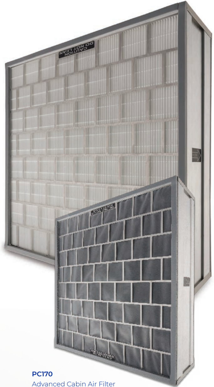
PC170 Advanced Cabin Air Filter

A-CAF is the combination of HEPA with an advanced activated carbon that further enhances aircraft cabin air quality by removing contaminants and odours, increasing crew and passenger comfort and improving airline operational efficiency.