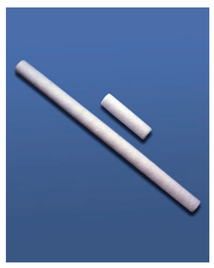
PhaseSep A/S Series Liquid/Liquid Coalescers shown