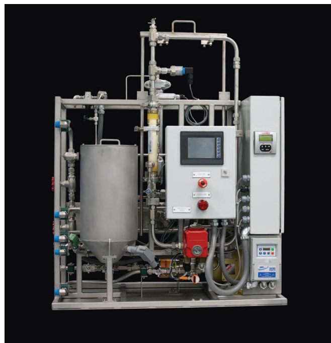
Pall's Research & Modeling scale (RAMs) crossflow filtration system.