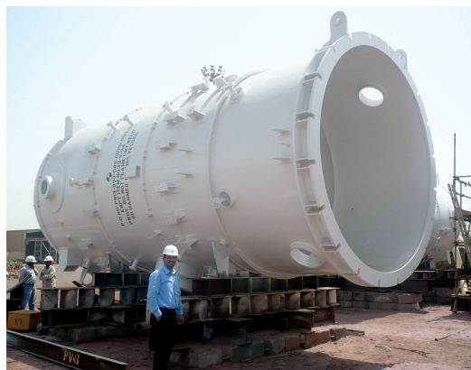
SepraSol Plus liquid/gas coalescer

After the solution was defined with the plant through several technical meetings, a major local contracting company, who was previously awarded another debottlenecking project, was requested by the plant to include the installation of two new SepraSol Plus liquid/gas coalescers in their scope. For the time being, Pall's coalescers are installed downstream of the existing filter-separators.