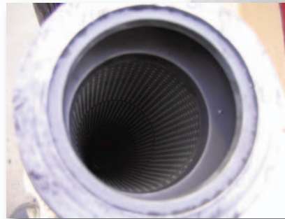
Inside of an Ultipor HT Cartridge Showing the Support Core