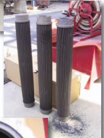
Used Ultipor HT Cartridges