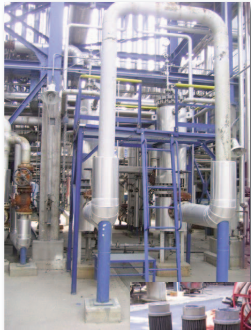
Installed Duplexed Filter Housings

In addition to the discussions carried out by Pall's local distributor, a detailed presentation was made at the AE&C's office. Process and mechanical engineers were very interested in learning all of the technical factors that enabled Pall to develop such a compact, competitive design. They were equally interested in discussing the many operating benefits derived from the use of Pall's Ultipor HT filter cartridges.