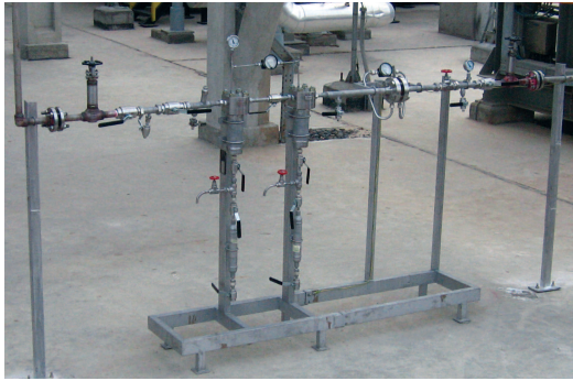
Pall's test unit for assessing liquid content in gas