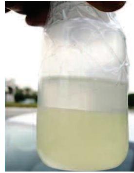
Sample taken from Pall's test unit