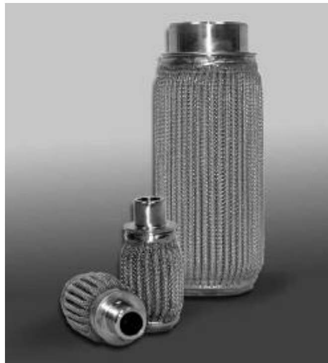
Pall Fit Series 63.5 mm/2.50" and 149.6 mm/5.89" elements shown