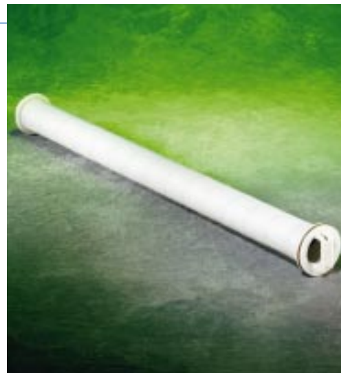
Pall PhaseSep HE Liquid / Liquid Coalescer