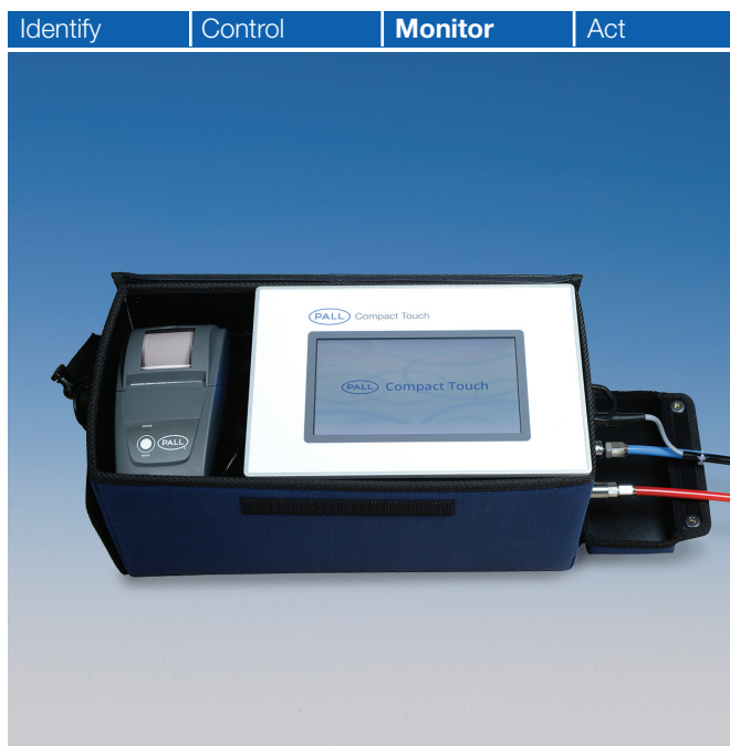
Compact Touch Integrity Test Device CT001

The Compact Touch integrity test device is fully portable, powered by battery or mains electricity, with a color touchscreen and multiple language options, making the integrity test process easier than ever before. With new auto purge and auto stabilization functions, together with the auto test function, the Compact Touch integrity test device reduces total preparation and test time, whilst optimizing test security, decreasing the risk of false results.