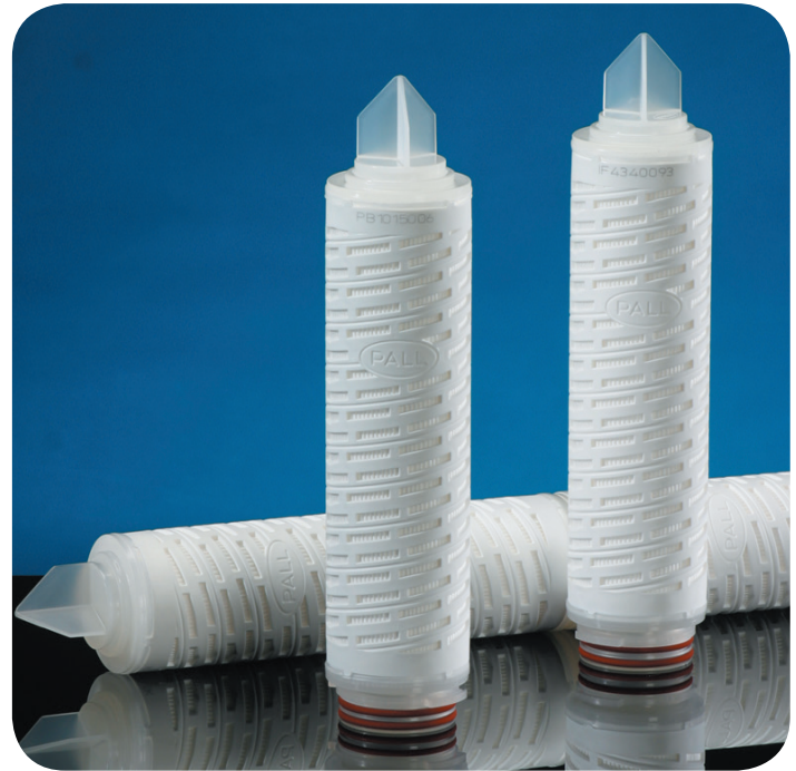
OenoClear Filter Cartridges