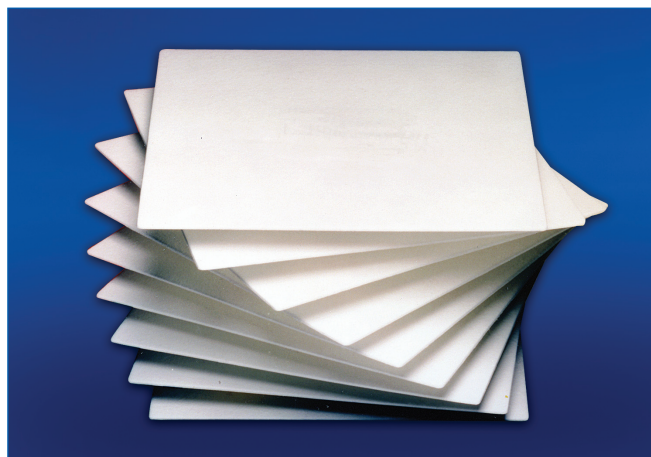
PERMAdur S Filter Sheets