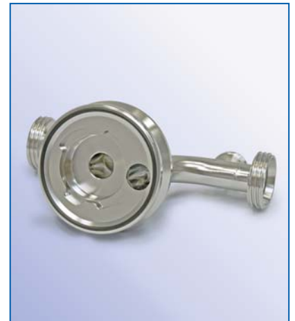
Figure 1b: Housing interior design ensures optimal cleanability in critical areas.