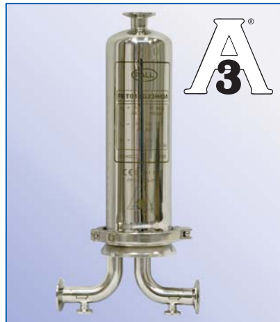
Figure 1a: Sanitary 3-A design option with clamp coupling or butt weld connections satisfies the requirements of 3-A Standard #10-04.