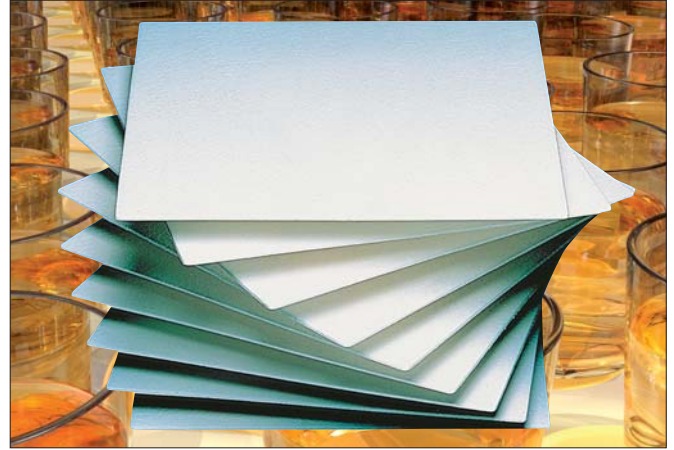
Seitz IR Series Filter Sheets