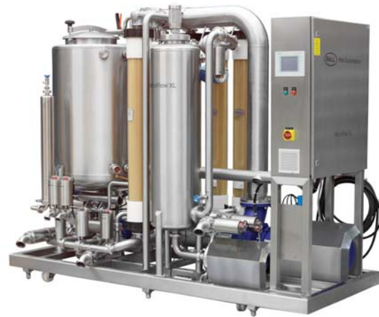
Pall Microflow XL-Brine Crossflow Microfiltration System