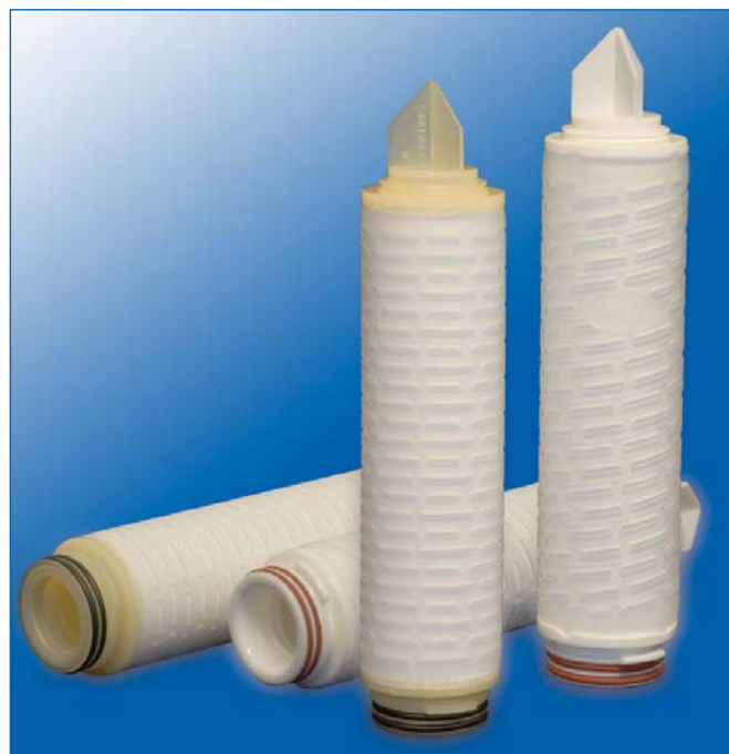
Ultipor N66 filter cartridges with nylon and polyester hardware