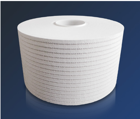
Figure 4: SUPRApak Plus is Pall's newest addition to the well-known SUPRApak product range.

High filtration area combined with enhanced filtration performance makes the SUPRApak product line an excellent fit for a wide range of brewery outputs, from about 1,000 to 4,000,000 hL per year.