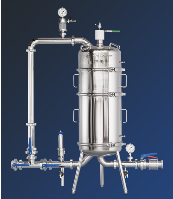
Figure 6: SUPRApak L-421 ( 4-high) housing, shown with standard accessories, can be operated as a 1,2,3 or 4 high housing.

In new installations, SUPRApak modules are installed in hygienic single and multi-round SUPRApak housings. Table 2 and Figure 5 show the sizes and available capacity of the most common housing options. In single-round housings, modularity of housing design enables the number of modules used in the housing to be varied to match changes in required production capacity (Figure 6).