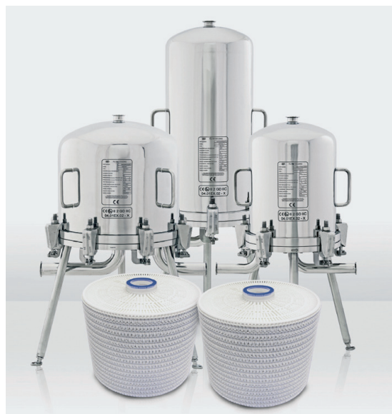
Figure 3: Pall's WSFZ housings for SD II modules provide flexibility in production. By installing internal center posts of different lengths, filtration can be run at 25, 50, 75 and 100% of capacity. Special adaptors enable retrofitting with SUPRApak modules as production capacity increases.

SD II modules in 287 or 410 mm (12 or 16 inch) diameter size are installed in sanitary lenticular housings holding from 1-4 vertically stacked modules (Figure 3). Flexibility in housing design enables the use of multiple lengths of hardware center posts that make it possible to use from 1.8 to 7.2 m 2 (19.4 to 77.6 ft 2 ) or from 5 to 20 m 2 (53.8 to 215.3 ft 2 ) of modules in the given housing, to accommodate different batch sizes.