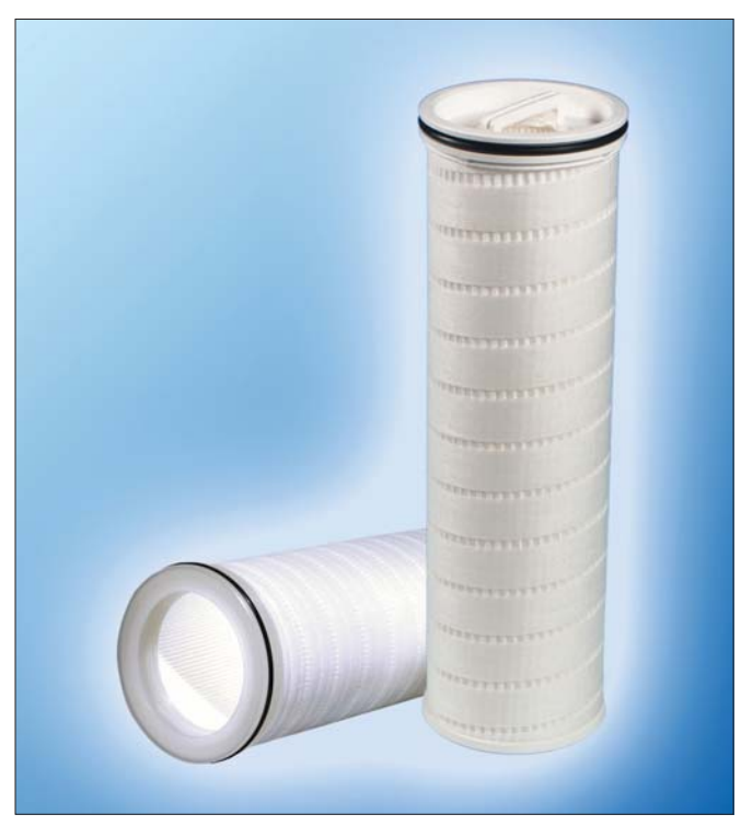
Ultipleat High Flow Elements